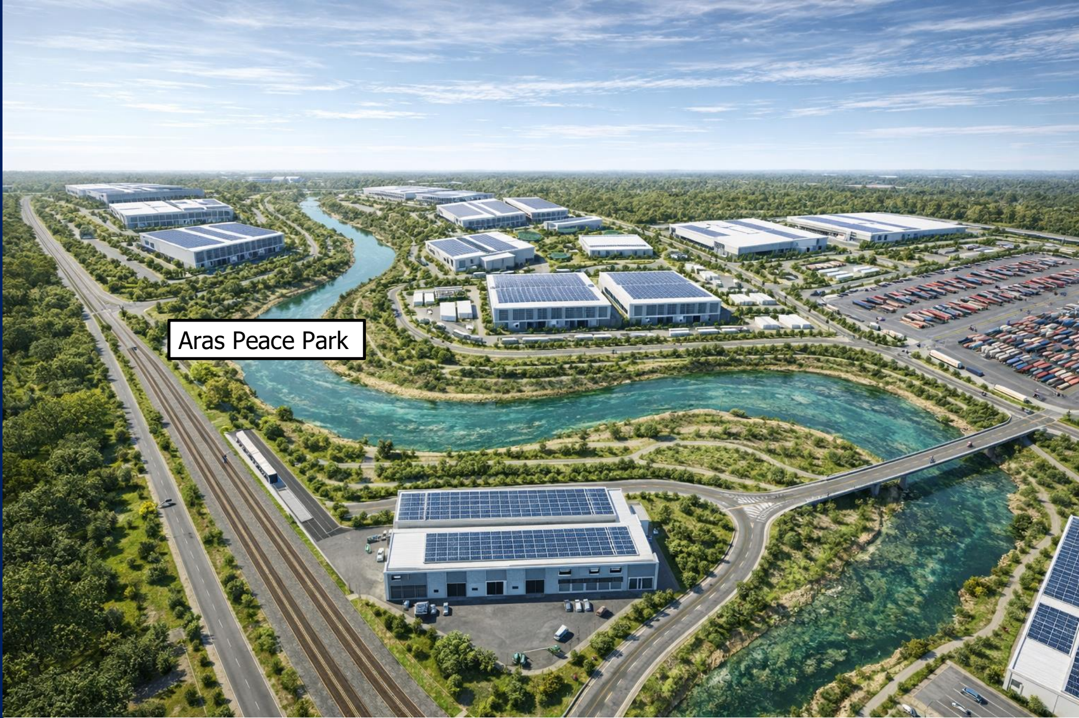
Aras Peace Park